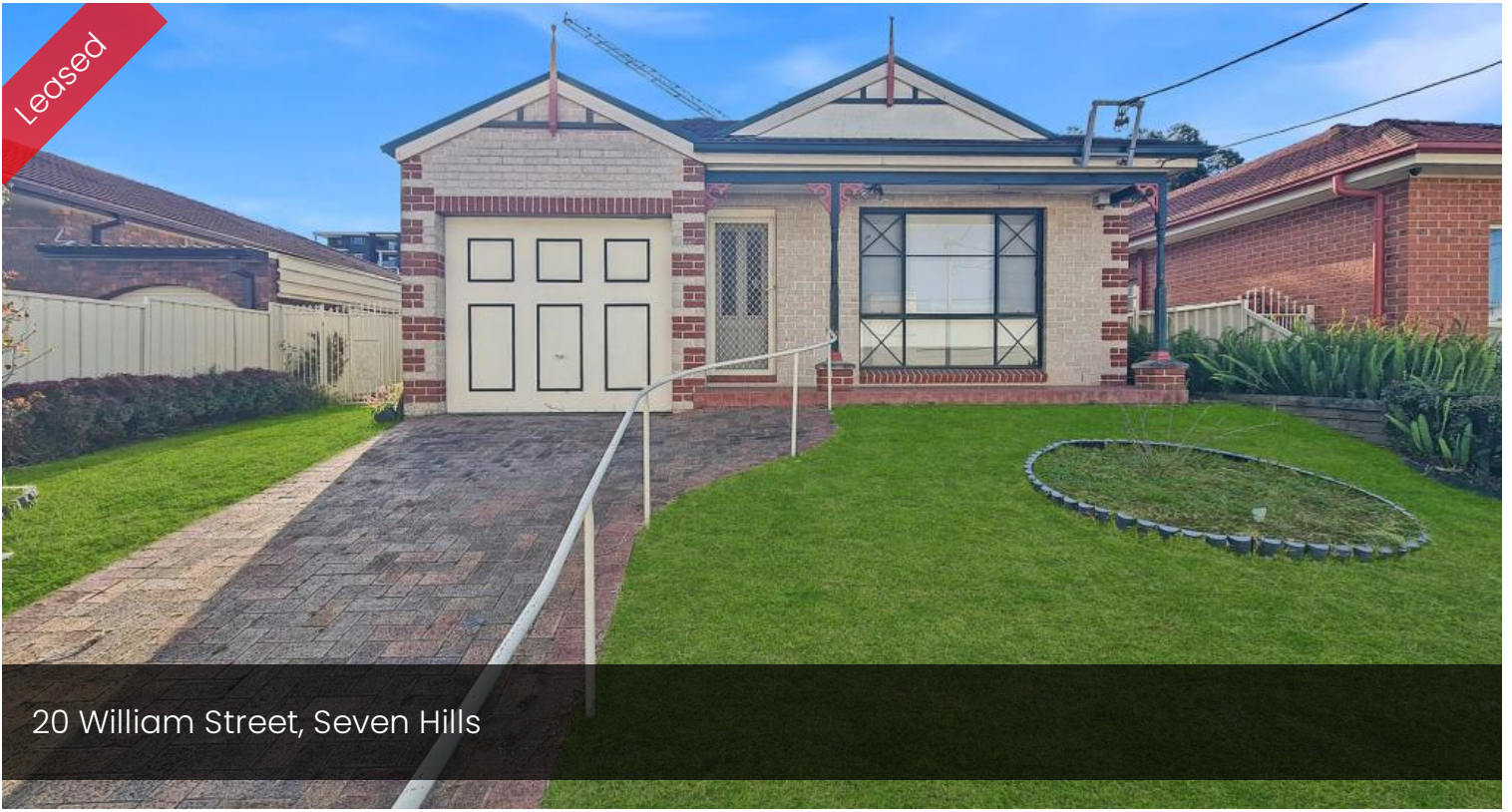
20 William Street, Seven Hills