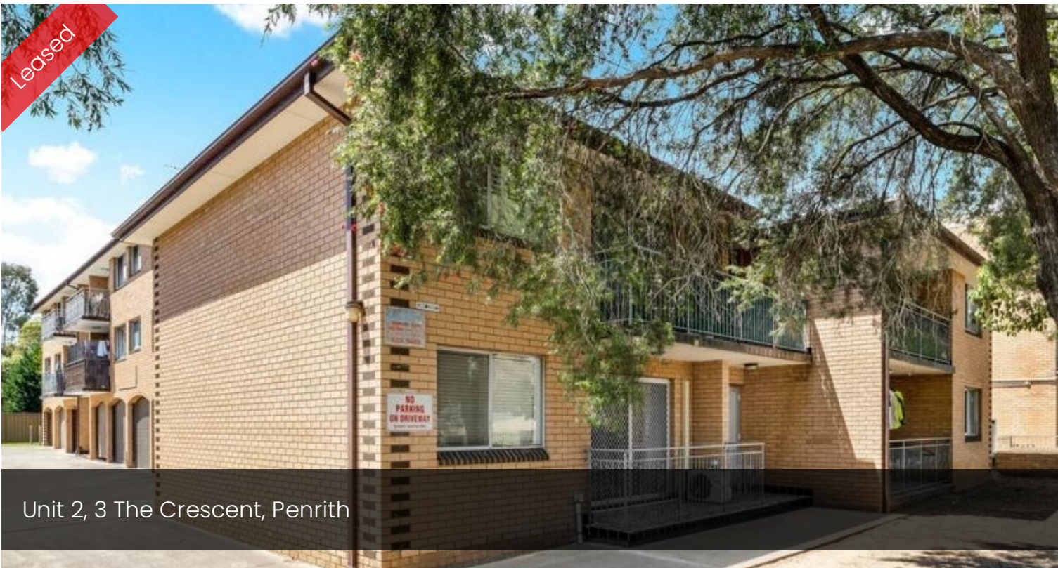
Unit 2, 3 The Crescent, Penrith