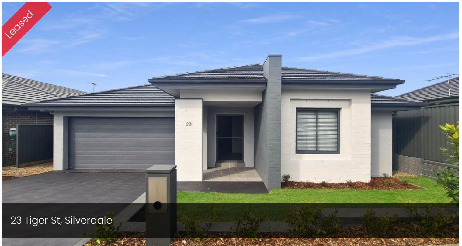
23 Tiger St, Silverdale